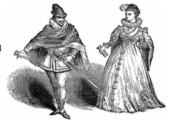
SMOD in history: Pimping it old-school.